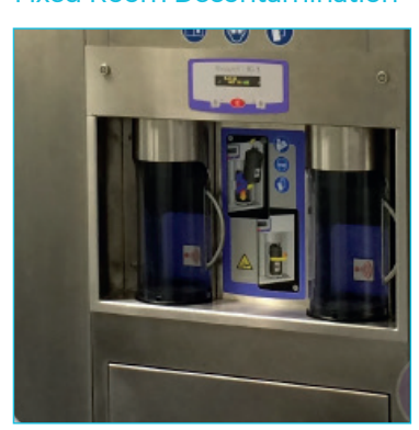
Can be used with high capacity Dual Bottle Module for fixed room gassing from a technical room