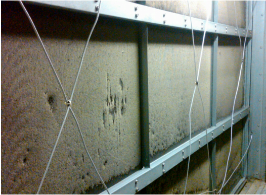
Air Handler #2 - before