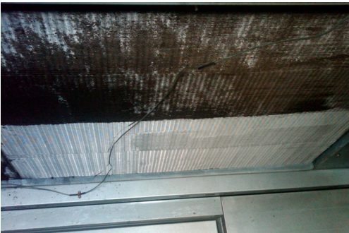
This photo shows a set of coils during the cleaning, visually demonstrating the results in mid-process