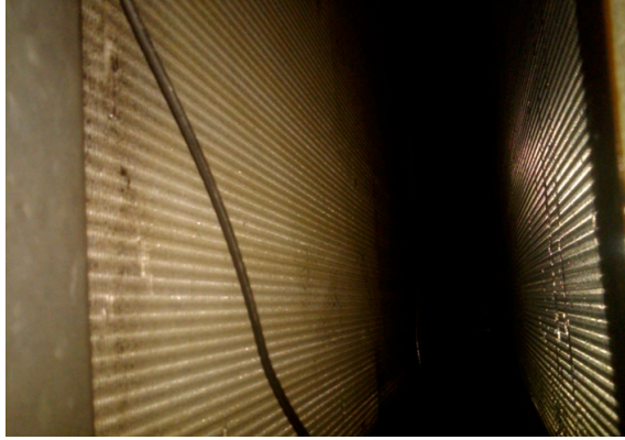
Air Handler #1 - after cleaning