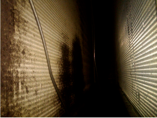
Air Handler #1 - before cleaning