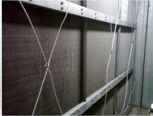
Air Handler #2 - after